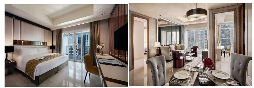
Figure 2.9 One-Bedroom Suite Residence

All guests can enjoy views of the Jakarta city skyline while staying in this one- bedroom residence suite. The size of this residence is around 861 square feet or 81 square meters, this residence has one bedroom which is located separately from the living room area.