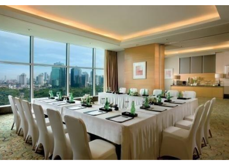
Figure 2.19 Meeting Room

The Ritz-Carlton Pacific Place offers meeting place to the guests which includes board meeting, business meeting, seminars, company meeting, etc. The meeting room located in 8<sup>th</sup> floor next to the Club.