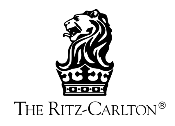
Figure 2.1 Hotel's Logo

1. The Ritz-Carlton Pacific Place History