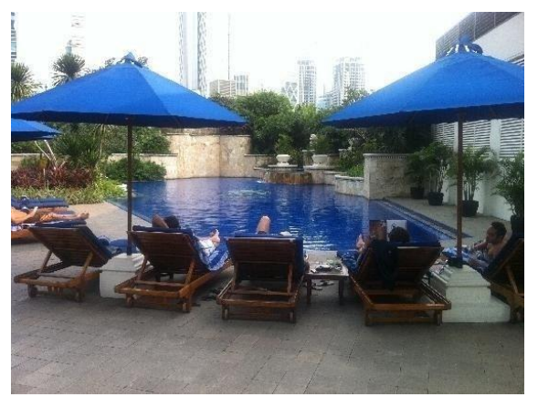
Figure 2.16 Swimming Pool