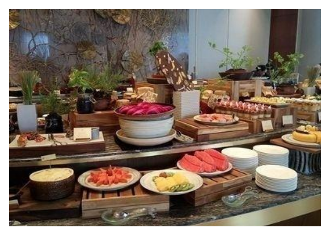
Figure 2.14 Pasola Restaurant's Food Dishes