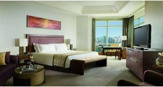
Figure 2.5Executive Grand Club Room

This room has Floor-to-ceiling windows with views of the Jakarta skyline and The latest in- room technological services with almost 900 square feet of space the maximum occupancy of 2 adults. The size of the room is around 893 square feet or 83 square meters. The same as the deluxe grand club room and the superior grand club room.