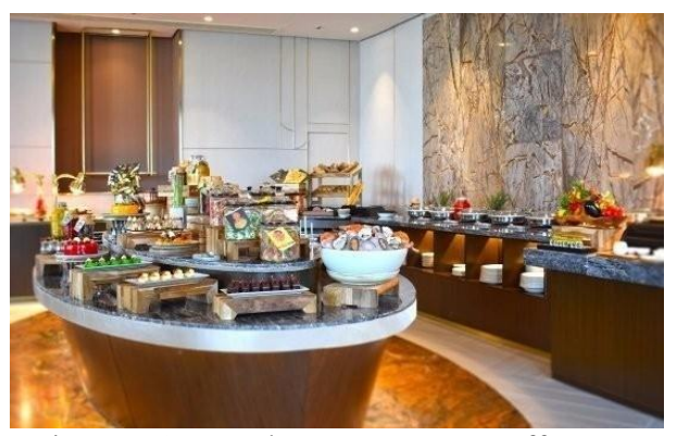
Figure 2.13 Pasola Restaurant's Buffet Area