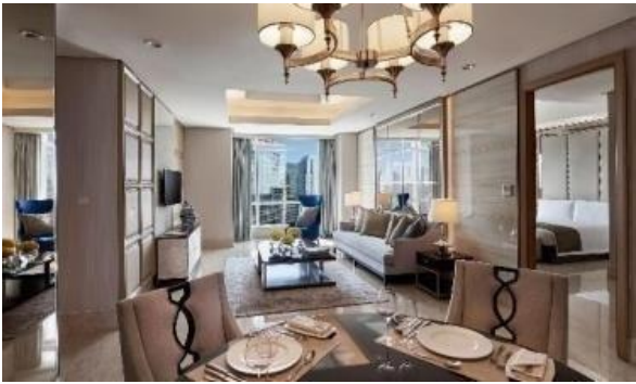
Figure 2.11 Three-Bedroom Suite Residence

This room has a total of 3 bedrooms. Just like the one-bedroom and two-