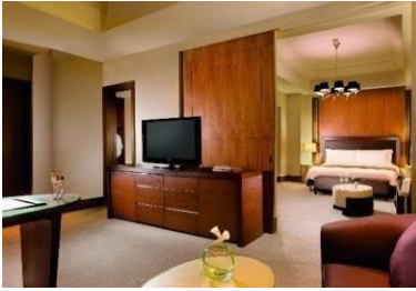
Figure 2.6 Mayfair Club Suite

This room has floor-to-ceiling windows with views of the Jakarta skyline and