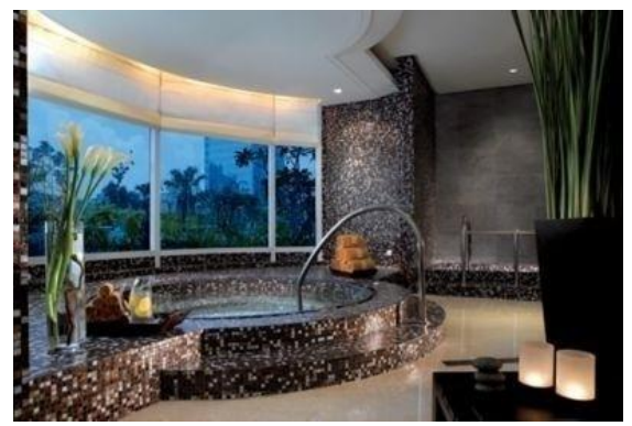
Figure 2.18 The Spa

The spa facilities offered by the Ritz-Carlton Pacific Place are located on the 8th floor. Guest can receive 60 minutes of Pacific traditional signature massage, 90 minutes of Chakra Crystal Stone massage, and 120 minutes of Javanese Royal Ritual.