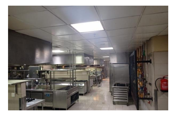
Figure 2.21 Banquet Kitchen