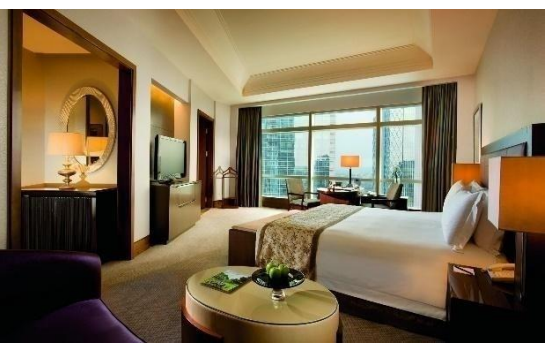
Figure 2.3 Deluxe Grand Club Room

This room type is claimed as the largest room in Jakarta which is around 775 square feet or 72 square meter and has a view of the Jakarta City Skyline.