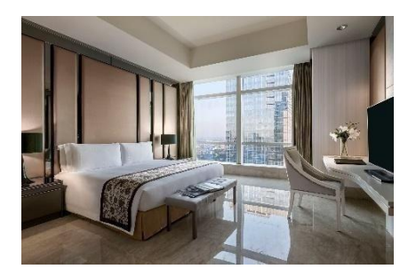
Figure 2.10 Two-Bedroom Suite Residence

The maximum occupancy of this accommodation is 6 adults. This suite size is around 1324 square feet or 123 square meter and has a total of twobedrooms that separated with the living room area. Guest can enjoy Jakarta city skyline at the balcony.