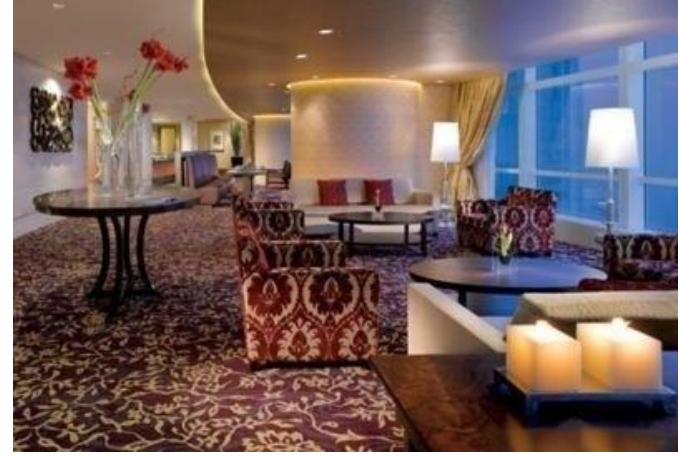
Figure 2.15 The Club Lounge

Pasola restaurant is open daily, from Monday to Sunday. For the opening hours, breakfast time starts from 6 am until 10 am. For lunch, it is open from Monday to Saturday, starting from 12 pm until 2 pm. Every Sunday, there is a brunch section that starts from 12 pm until 3.30 pm. Lastly, for the dinner time starts from 6 pm until 9 pm every day.