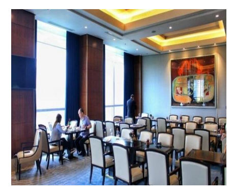
Figure 2.12 Pasola Restaurant's Dining Area

The dining area offered by the Ritz-Carlton Pacific Place is called Pasola. This restaurant is a private all-day dining restaurant that offers Asian fare, start from the buffet, a la carte, signature cocktails, and wine.