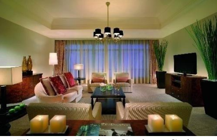
Figure 2.7 Ritz-Carlton Suite

This suite maximum occupancy is for 3 adults, provide king beds, a crib and connecting rooms depends on request, the total size of the room is around 1830 square feet or 171 square meters. There is a separated spacious living room and master bedroom facility that can be used by the guest while staying at this suite.