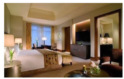
Figure 2.8 Presidential Suite

One of the strengths of this suite is the unmatched skyline view with 180 degree view of skyscrapers and overviewing city landscapes. The size of this suite is 3659 square feet or 340 square meters with the maximum occupancy of 3 adults. There is a separate living and dining area in this suite.