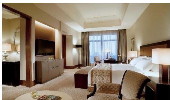
Figure 2.4 Superior Deluxe Grand Club Room

The size of this room is around 786 square feet or 74 square meters with the maximum occupancy of 3 adults. The same as the deluxe grand club room, this room also has a Jakarta city view.