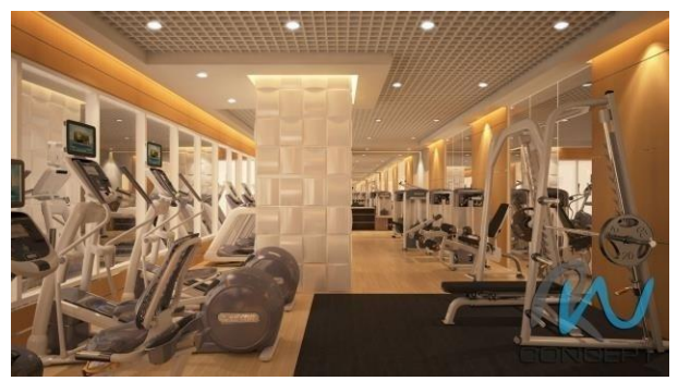
Figure 2.17 Fitness Center

Fitness center or gym can be used by the guests and staff. The facility is located on the 8^{th} floor of the hotel's building, near the spa area, next to swimming pool and glass house.