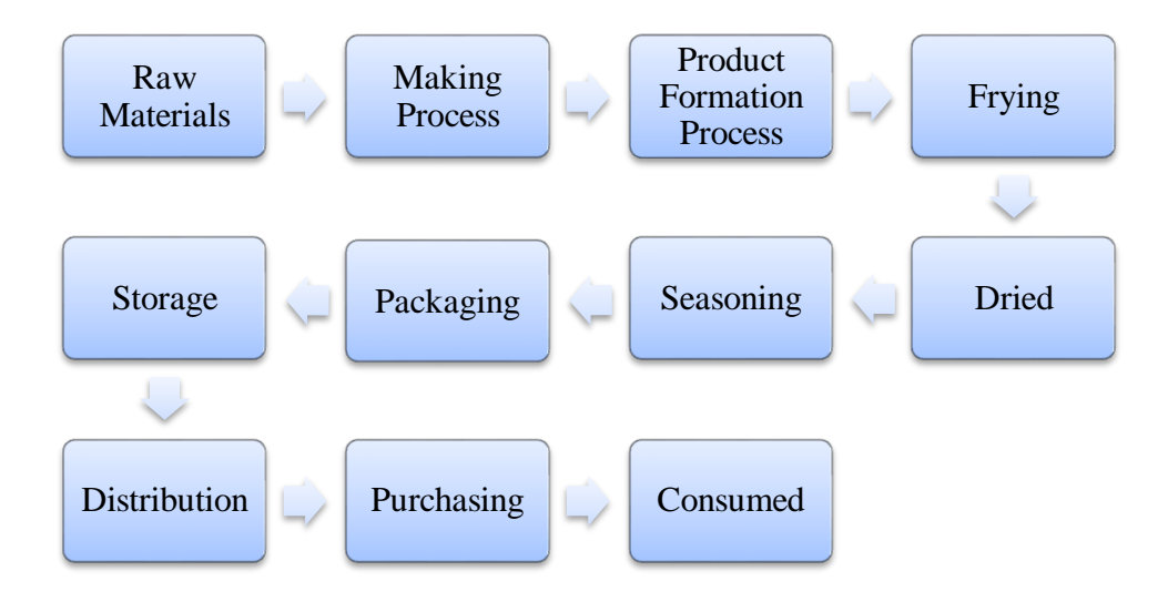
Chart 3.7 Manufacturing Chart

The process of making Maofish products is done with very carefully and regularly to produce a quality products. The product's initial manufacturing process starts with the main raw material, that is mackerel fish which has been finely ground. In the making process, mackerel fish are mixed with several other ingredients such as flour, salt, pepper, and others. In this process, attention is paid to produce products with delicious taste. Furthermore, the dough shaped and thinned to create a crunchy product and fried using an air fryer at 200 degrees Celsius for 15 minutes. After that, dried for 30 minutes at room temperature, seasoned, and do the packaging. Before the distribution, keep in storage for a day to double check regarding the product's completeness and the company distribute to souvenir stores, restaurant and online stores. Lastly, the products are purchased directly by consumers in souvenir stores or online stores without pre-orders and consumed.