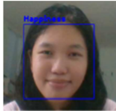
Fig. 3. Emotion Detection Example

OpenCV Library. Models created are loaded with the TensorFlow library. After that, video detection is made in real-time using video capture in the OpenCV Library. The loaded model is used to predict the image captured by the video webcam and the prediction results are displayed on the video in Fig 3.