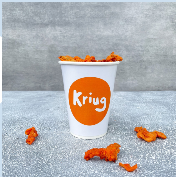
Figure 1.2 Kriug product example

Kriug is a business brand that serves freshly fried crisp or snacks that contains Oyster Mushroom and Spinach by frying it in the flour and serve it in the same portion. The production of this food will be taking place in a booth stand. To give the customers the best experience to eat the crisps, Kriug will provides the product to the customers with 12 oz paper cup and chopsticks so the customers can grab the crisp easily. The price will be Rp. 15.000 per cup and this price is available for every flavours. The flavours would come from seasoning powder which includes BBQ, seaweed, original, and balado. The customers can find Kriug at offline store with the booth stand itself, and also can be found on Instagram & Tik Tok, and also available to order online at Grab food and Gojek.