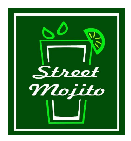
Figure 1.1 Logo

Street Mojito logo inspired from the mojito itself, there are lime and mint leaves which are ingredients of mojito. The philosophy of the green color on this logo is associated with the natural world. Because of its relationship with nature and considered a calming and relaxing color. The writer hope that this product can provide fresh and relaxing effect for customers.