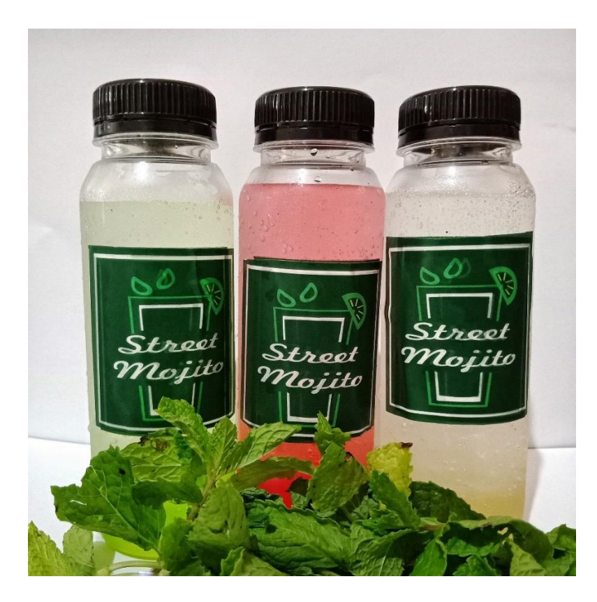
Figure 1.2 all variants