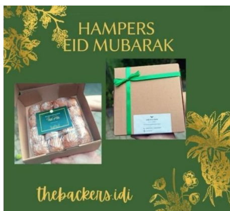
Figure 3.8 Instagram Content