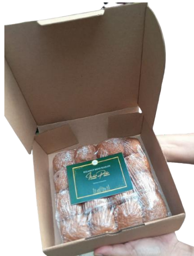
Figure 3.6 The Ba(c)ker's Ramadan Edition