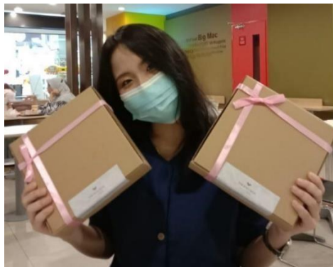
Figure 3.2 The Ba(c)ker's Customer