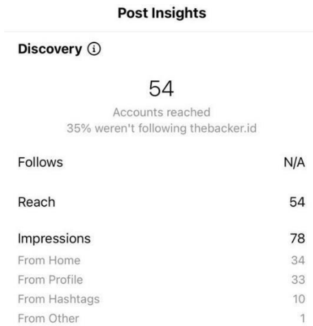
Figure 3.10 Instagram Insights

The Ba(c)ker sells 10 boxes of Japanese Milk Buns and 6 packs of Spring Rolls during the event.