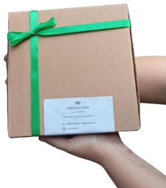
Figure 3.7 Ramadan Edition Packaging