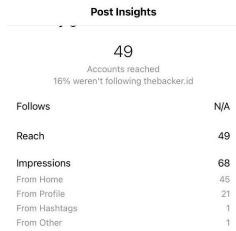
Figure 3.11 Instagram Insights

Instagram Insights is a feature on Instagram. The use of this feature is to analyze, to provide data of the followers actions regarding the user post so that the user can know the most effective content to be published on Instagram. One of the feature is “reach” in which the feature let the marketing division know how many accounts viewed the content of The Ba(c)ker. While other feature “Impressions” let the marketing division knows how many times any Instagram users checked The Ba(c)ker ontents. The Instagram users who can see the content of The Ba(c)ker are not only the followers but public, and they can find and see it from the hashtags that The Ba(c)ker made.