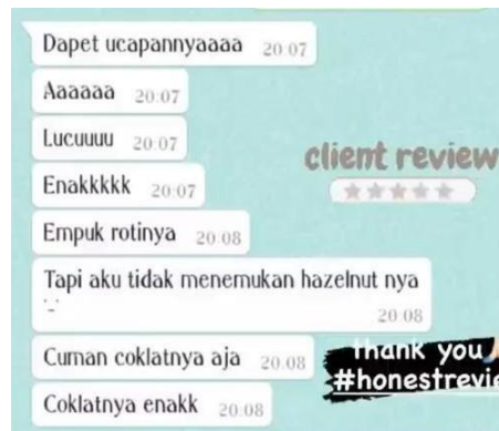
Figure 3.3 Customer's Review

Marketing staff set sales targets 25 boxes during the event, promotions are carried out to attract customer interest. The Ba(c)ker only sells 3 boxes of Japanese Milk Buns during the event because of the standing mixer was broken, so the company could not receive any order.