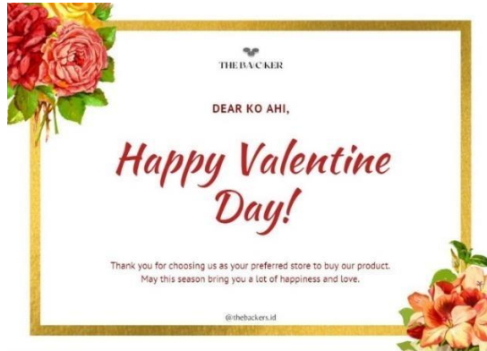
Figure 3.1 Valentine Greeting Card