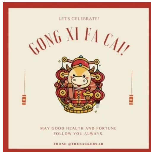
Figure 3.5 Instagram Content