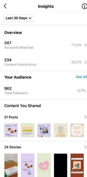
Figure 3.14 Instagram Insights

The marketing staff also control the social media every day. It is important to know the effectiveness of promotion and content distribution, and to know when followers on Instagram are active.