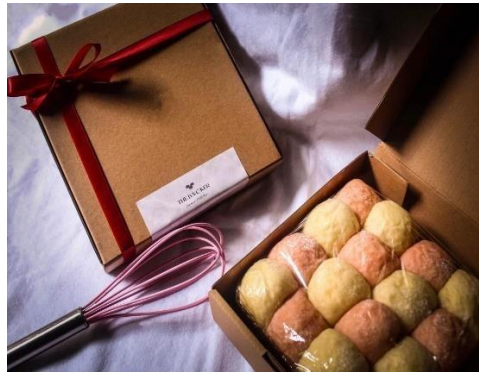
Figure 3.4 Chinese New Year Packaging