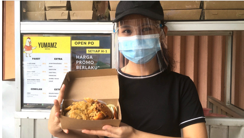
Figure 1.1. Writer with the Product

Entrepreneurship is an activity to create a new business by an entrepreneur who takes responsibilities and risks also can enjoy the rewards of opening a business. To compete with many competitors, Entrepreneurs need to have several things. It is constantly able to innovate, be thorough, have good leadership skills, know the products nicely, have visions to achieve and flexible, or know the situation. One example is during this Pandemic. This is useful so that the business built can keep up with the times and struggle with other businesses.