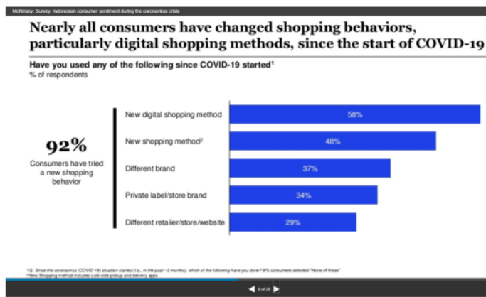
Figure 1. Changing of Indonesia shopping behavior during the Covid-19 pandemic.

This technology services assisted Gramedia in facing the decreasing sales volume from the bookstore business due to the Covid-19 pandemic and anticipating the growing number of customers who are shopping online. The following figure showed that there is a shifting customer purchase behavior in Indonesia during the pandemic Covid-19 since there is 92% of consumers have tried a new shopping behavior and 58% adapted the new digital shopping method.