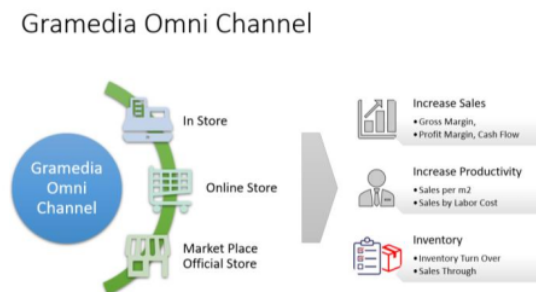
Figure 6. Conceptual Framework

The effectiveness of implementing the omnichannel strategy to increase organization performance in bookstore retailers like Gramedia will be determined by the KPI's of Sales, Productivity & Inventory as described in Figure 6. To increase sales, customer experience is the most important variable to be improved. To increase productivity, the usage of space both online or in-store should be optimized as well as the productivity of people and any other cost. inventory also the main issue, to be handled effectively and efficiently. How to monitor the inventory turnover, the distribution of the inventory, from printing to warehouses to stores or fulfillment center.