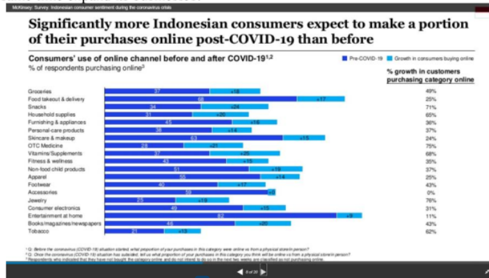
Figure 3. Comparison of Consumers' use of online channels before and after Covid-19. Source: (McKinsey, 2020)

Meanwhile, Figure 3 showed that the Covid-19 pandemic had encouraged Indonesian customers to purchase the products through an online system. There is a 43% growth of customers who purchase the books/magazines/newspaper through an online system. This growing number of online customers brought a huge opportunity for Gramedia to survive and at the same time expand its businesses.