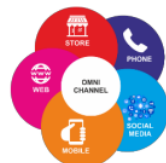
Figure 5. Omni Channel

Rigby was the first to mention the term in the academic literature by defining omnichannel retailing as: “an integrated sales experience that melds the advantages of physical stores with the information-rich experience of online shopping” [1]. We observe that the definition was extended to the point that it involved not just the simultaneous use of channels, but the experience that derives from the integrated combination of them. The last attempt to define the term was by Levy, et al. (2013), who introduced “Omni retailing” as: “a coordinated multichannel offering that provides a seamless experience when using all of the retailer’s shopping channels”. They all agree that the prevalent notions are integrated/seamless experience using all channels. [2]