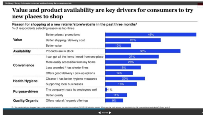
Figure 4. Customers key drivers in doing online shopping.

shopping, 38% of customers are looking for product availability and 28% of customers considered the delivery cost as an additional value.