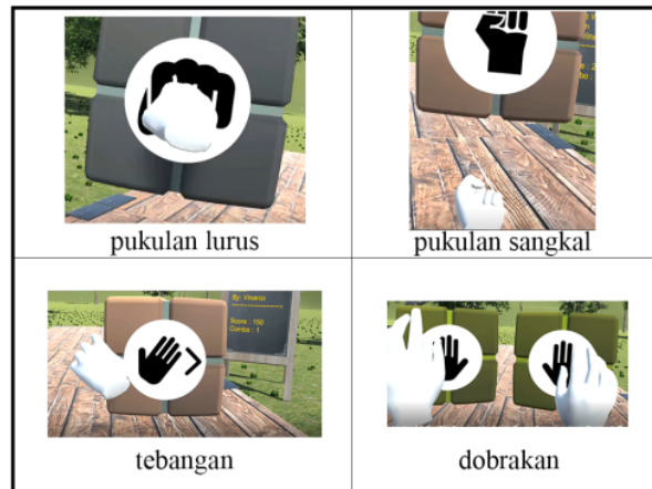
Fig. 2. Main game screenshot