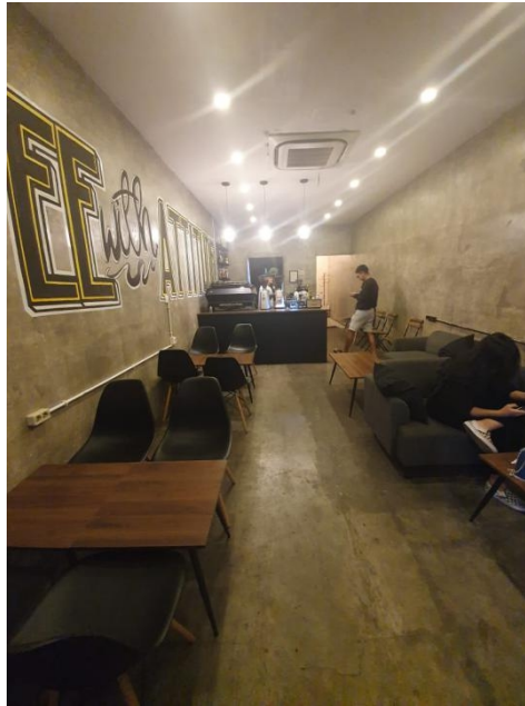
Picture 3.3 Sacks Coffee