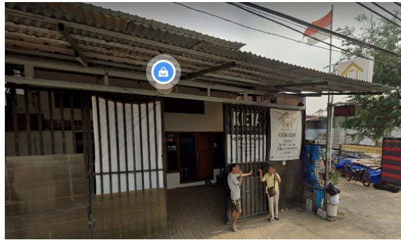
Picture 3.1 Kieta Coffee

The location of Kiss Pride will be divided into two places. For coffee production, it will be carried out at Kieta Coffee. Kieta Coffee is located in Jalan Rawa Kutuk No. 27, Serpong Utara, Tangerang Selatan.