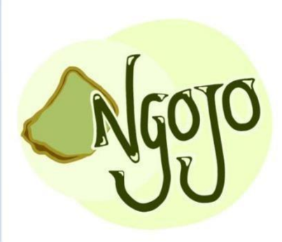
Figure 1.1 Company Logo

Ngojo is one of a home patisserie business that included as a Small & Medium Enterprises (SMEs) or known as Usaha Kecil Menengah (UKM) inbahasa. This business is selling one of traditional cakes that originally from a city in South Sumatera called Palembang. The main reason of writer to choose this traditional cake from Palembang as the company main product is because Palembang city is the writer's hometown. The traditional cake is called "Kojo". Kojo is a light green colored cake that has pandan flavor. The name of this cake has the meaning of "Kemojo" or "Frangipani" because the shape of the skillet resembles a frangipani flower.