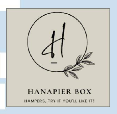
Figure 1.1 Company Logo

Hanapier Box is a Hampers that be divided separately according to Hamper's type such as 90's Snack Hampers, Scented Candle Hampers, and Body & Hair Care Hampers. The brand name comes from the Hampers that the French called "Hanapier". The logo itself is to represents the company name, and the tagline is to persuade a customer to buy the product.