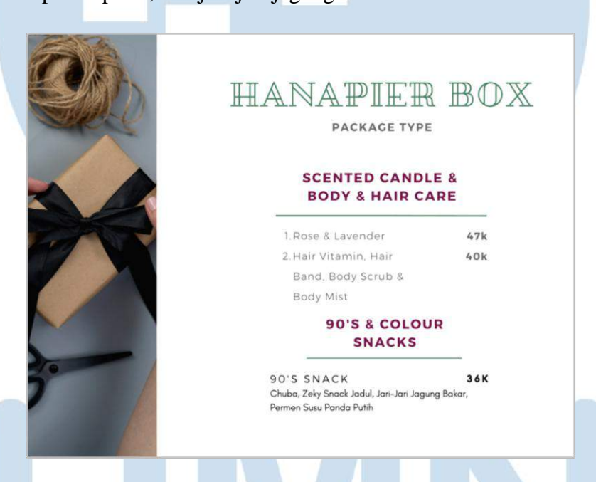
Figure 1.3 Package Type

ages and skin. The owner can utilize and purchase items from well-known brands with neutral applications. Body scrubs, perfume, face masks, body lotions, and shampoos are just a few examples. Body & hair care Hampers will certainly be highly valuable, and people who get them will be able to use them daily. A mix of current skincare brands can also be used to minimize the price. Snack Hampers also have various types, such as 90s snacks. Old snacks have now been forgotten because of the existence of modern snacks, but the taste of nostalgia with 90s snacks will never lose their taste. The 90s snacks such as chuba, zeky snack jadul, permen susu panda putih, and jari-jari jagung bakar.