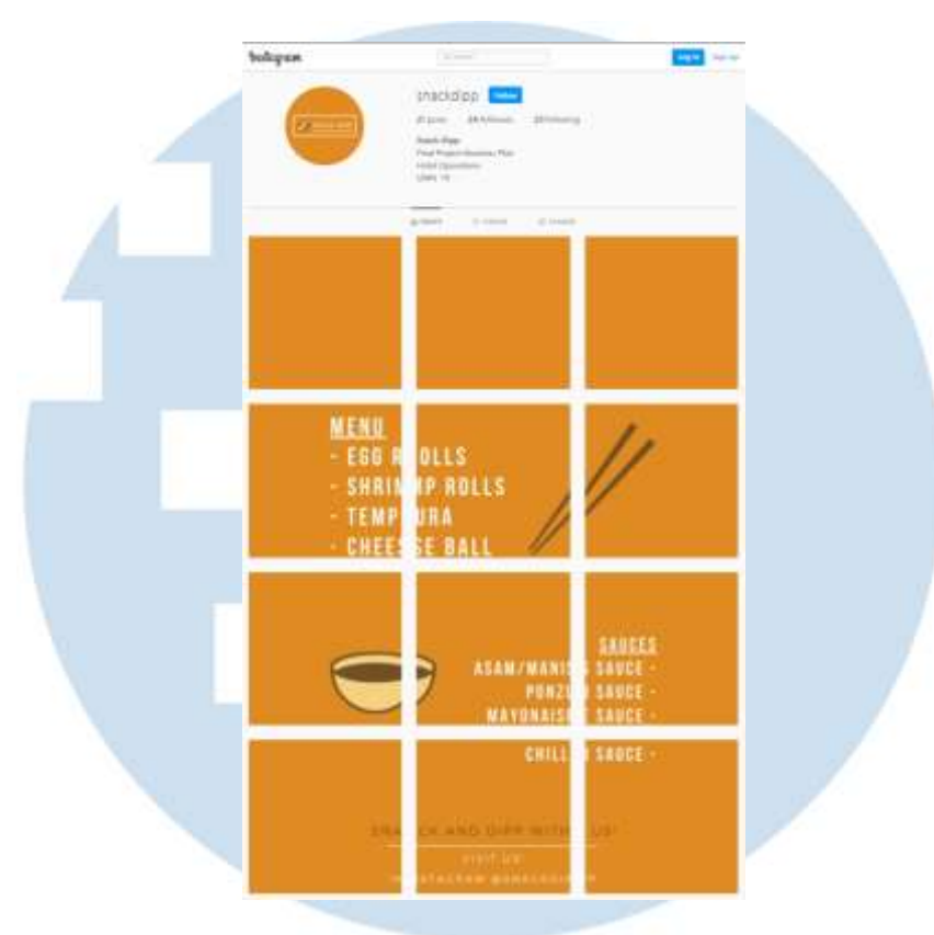
Figure 5.3 Instagram