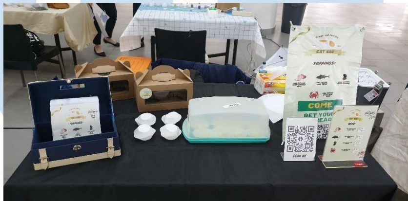
Figure 5.3.1 EAT EGG Product presentation

During the exhibition, EAT EGG provides a food display on a paper cup. For the tester, EAT EGG brings and shows all variants of flavor and topping that EAT EGG have. and put one cup to serve one topping.