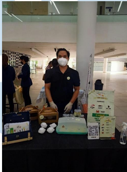
Figure 5.1.1 Booth Exhibition

Final project exhibition held on 12 th November 2021 at lobby D P.K Ojong Universitas Multimedia Nusantara. The exhibition starts from 07.00 am until 12.00 pm.