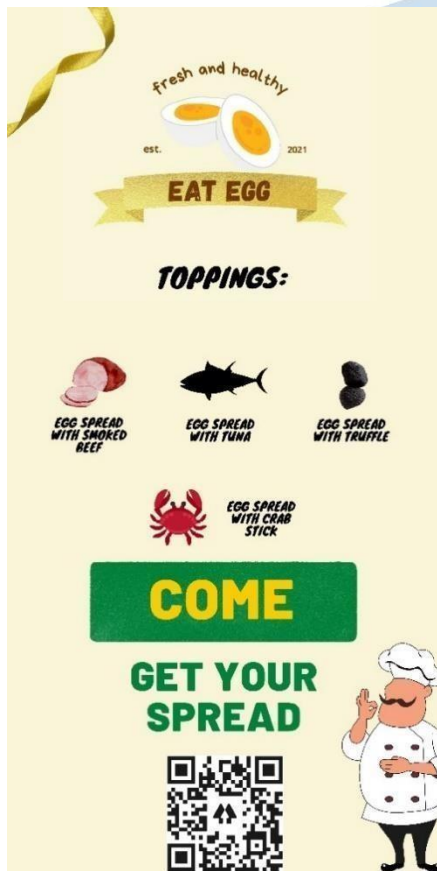
Figure 5.4.1 Banner layout