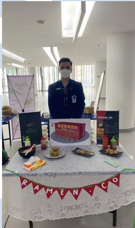
Figure 5.1 Exhibition 1

Final project exhibition held on 12 th November 2021 at lobby D Universitas Multimedia Nusantara. The exhibition starts forms 09.00 am until 12.00 pm.