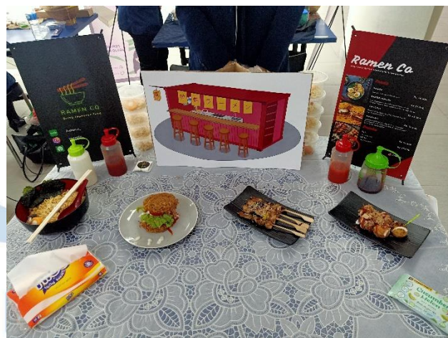
Figure 5.3 Exhibition 3