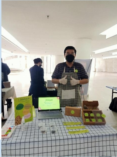
Figure 5.1.1 Booth Exhibition

Final project exhibition held on November 12 th 2021, located on Lobby D P.K Ojong, Universitas Multimedia Nusantara. The final project exhibition itself starts from 07.00am until 12.00pm with inviting some panelist from hotels, and related lecturer from Hotel Operations Program Universitas Multimedia Nusantara.