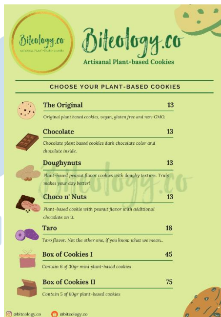
Figure 5.4.1 Banner Layout 1