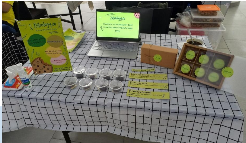
Figure 5.3.1 biteology.co product presentation

While in the final project exhibition, biteology.co product provides tester on a thinwall along with the food grade oxygen absorber in order to prevent the wind that enters from outside the thinwall which can cause the product to become unfit to be consume for panelists.