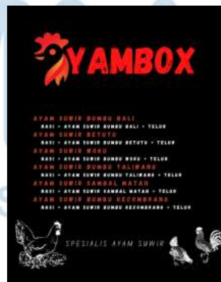
Figure 4.3 brochure layout