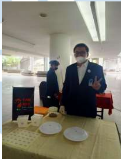
Figure 4.1 Booth Exhibition

Final project exhibition held on 12 th November 2021 at lobby D P.K Ojong Universitas Multimedia Nusantara. The exhibition starts from 07.00 am until 12.00 pm.