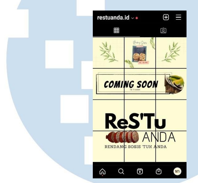
Figure 5. 8 ReS'Tu Anda Instagram view

The media and promotion will be using Social media, Instagram for the promotion. ReS'Tu Anda can be found with searching @restuanda.id in Instagram to find more information. For those who are not using Instagram, ReS'Tu Anda can be found through WhatsApp number (0878-0803-3561).