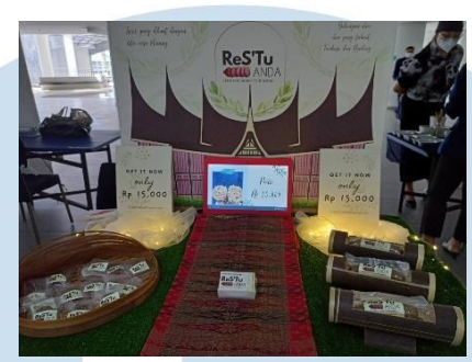
Figure 5. 7 Booth looks

In the exhibition, there are many components on the booth. First the background is representing Rumah Gadang, a traditional house from Minang. Second, the fabric on the center of the booth, it's called Songket, Songket is a traditional fabric that is handmade. On the middle, there is an automatic presentation that explain about the product and a box of name card that the guest can get. On the presentation sides, there are a price tag for the product. The main item, Rendang Sosis is in the right and left side. Rendang sosis that located on the left side is the taster part, sliced of Rendang Sosis that can be taste. Meanwhile the main product is on the right side, the whole Rendang Sosis packed inside a vacuum packaging.