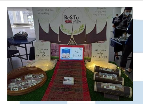
Figure 5. 3 Booth Looks