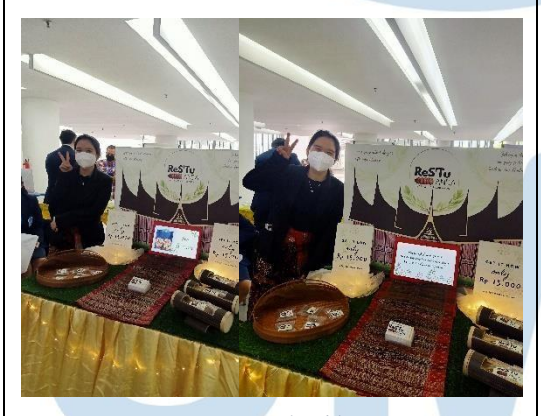
Figure 5. 5 Booth with owner