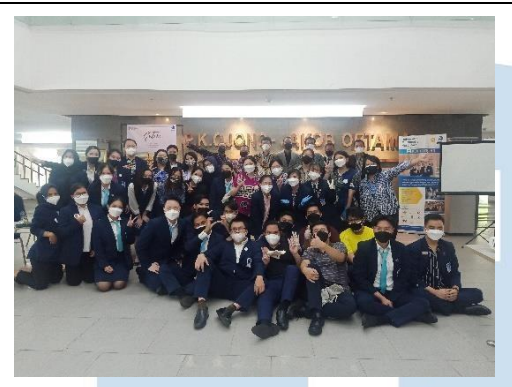
Figure 5. 6 Group photo