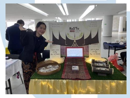
Figure 5. 4 Booth with owner