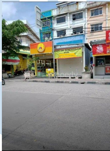
Figure 3.1 Figure of location miska food

Miska food has a strategic location at Jl. Kramat raya, Koja, North Jakarta. The location is close to the shopping center in Koja, close to Jakarta Islamic centre, and is