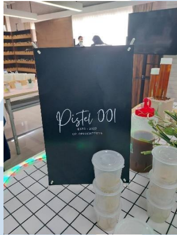
Figure 5.5 Promotional Tool (Mini Banner)