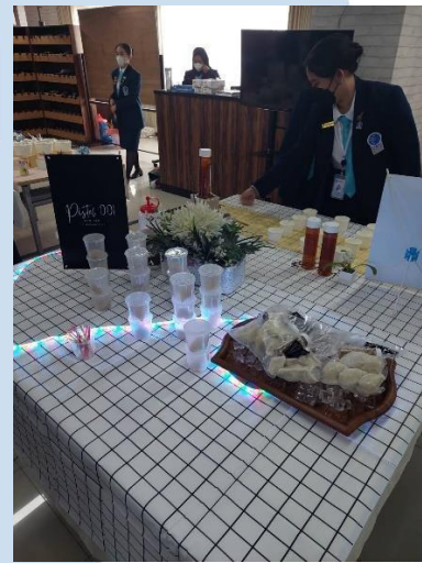
Figure 5.1 Exhibition Table Figure 5.2 Exhibition Location