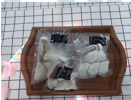
Figure 5.3 Pistel001 Products

The product of Pistel001 is a frozen pempek. For the exhibition the presentation for the products are 3 variants of pempek such as Pempek Pistel, Pempek Kapal Selam Mini, and Pempek Mozzarella. Beside the products, the writer also provides testers for each product in a plastic cup.