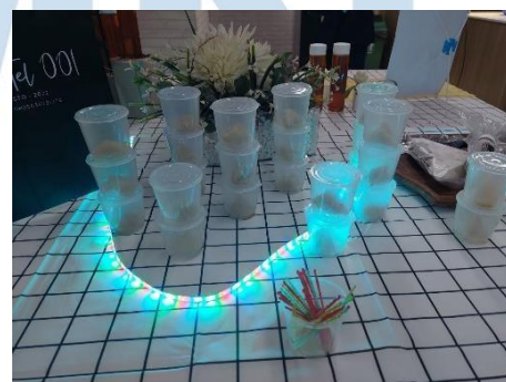
Figure 5.4 Pistel001 Exhibition Testers