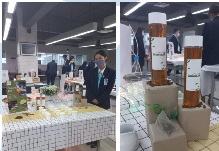
Picture 5.2 Exhibition