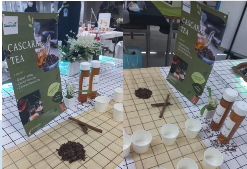
Picture 5.3 Product Presentation