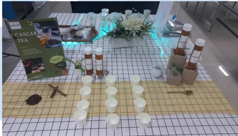
Picture 5.1 Exhibition

The exhibition is held in the hotel restaurant lab where tables are available for students to prepare products to be assessed by the examiners.