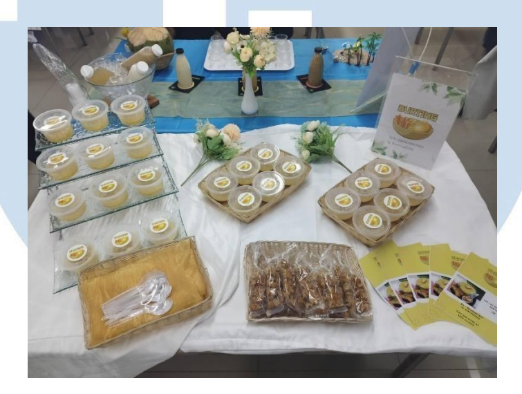
Figure 5.1 Venue

The Bubur Ponti 88 product exhibition will be held on November 28, 2022, which is located at Multimedia Nusantara University Building D, 3rd floor, which is the location for the hospitality study program.