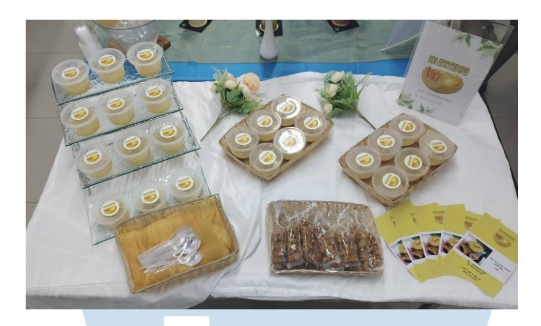
Figure 5.2 Product Presentation