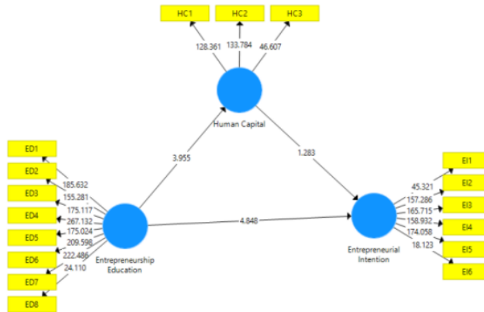
Figure 2. Inner Model Test Results