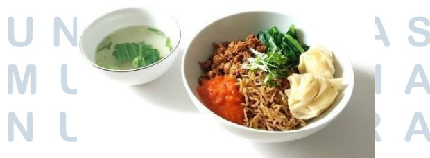
Picture 5.3 Chicken Bakmie with Dumplings

The chicken bakmie with dumpling is consist of a rich seasoned chewy noodle dish that served with minced chicken topping, blanched chaisim, sliced scallion, chicken dumpling, and chicken stock for the soup. For the price of one portion chicken bakmie with dumpling is around Rp25,000.