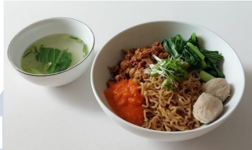
Picture 5.4 Chicken Bakmie with Meatball

The Chicken Bakmie with Dumpling is consist of a rich seasoned chewy noodle dish that served with minced chicken topping, blanched chaisim, sliced scallion, meatball, and chicken stock as the soup. For the price of one portion chicken bakmie with meatball is around Rp25,000.