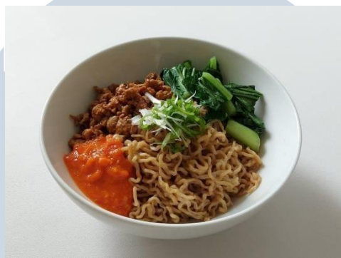
Picture 5.2 Original Chicken Bakmie

The Original Chicken Bakmie is a rich seasoned chewy noodle dish that served with minced chicken topping, blanched chaisim, sliced scallion, and chicken stock as the soup. For the price of one portion original chicken bakmie is around Rp20,000.