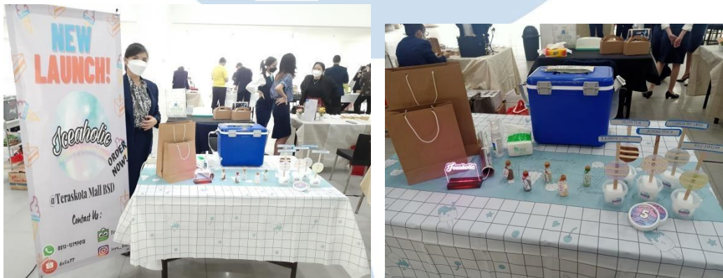
Figure 5.1.2 Iceaholic Booth

Decorative name lamp made of acrylic called "Iceaholic" and a small glass bottle containing flavoring powder for Iceaholic ice cream are shown in the illustration above. One of the promotional forms used is an X-banner, and there is a lighted acrylic called "Iceaholic" and a small glass bottle containing flavoring powder for Iceaholic ice cream. Paper bags and aluminum foil rolls are the next types of packaging used. Then, there is the ice box on the table, which contains a product tester and an ice pack. When entering the exhibition area, hand sanitizer, masks,