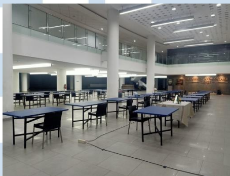
Figure 5.1.1 Exhibition

The exhibition “Entrée” will take place in the Lobby PK Ojong of Building D at the Universitas Multimedia Nusantara on November 12, 2021. Iceaholic was first introduced at this exhibition. Iceaholic's participation in this show is depicted in the image below: