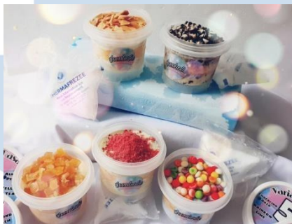
Figure 5.3.1 Iceaholic Product

Iceaholic sold a product in the form of a layer of ice cream cake with toppings on it at the "Entree" exhibition. They are delivered in non-disposable 125 ml cups that may be washed and reused for chili, seasoning, or other storage containers. Chocochino Oreo, Almond Peach, Rainbow Lime, Yellow Tea, and Red Matcha are among the five flavors available at Iceaholic.