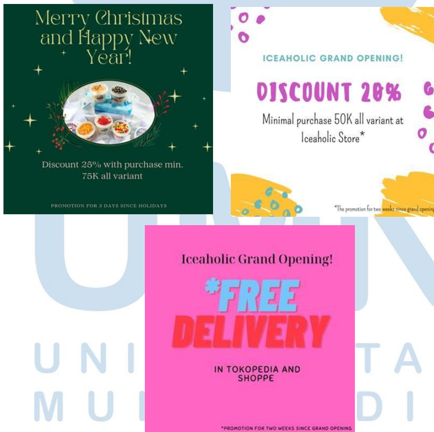
Figure 5.3.3 Instagram Promotions