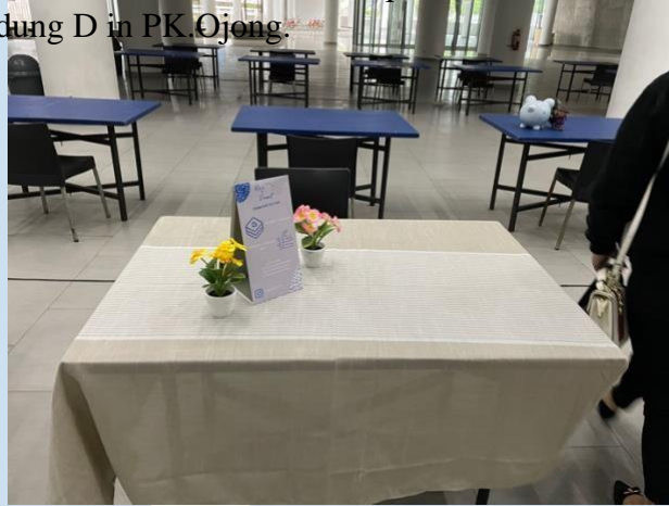
Picture 5.1 Exhibiton