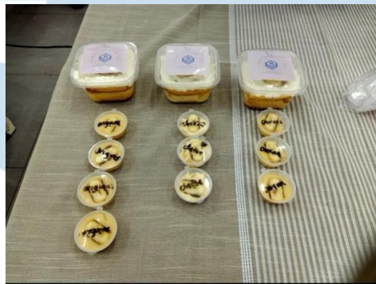
Picture 5.3 Product Presentation

The products that presented to the judges is all the product that this company offer with a small taster bites for the judges to taste. The owner brought 10 pcs of taster of cake series with various of sauce, the owner made a mini buffet for the pancake series which consist of small pancakes, pisang epe that is cut into small cubes and sauce.