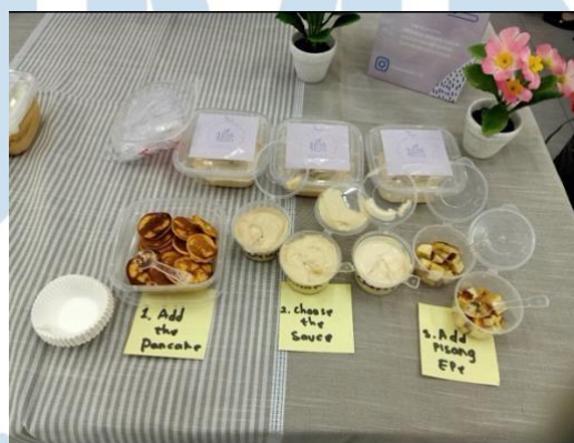
Picture 5.4 Product Presentation