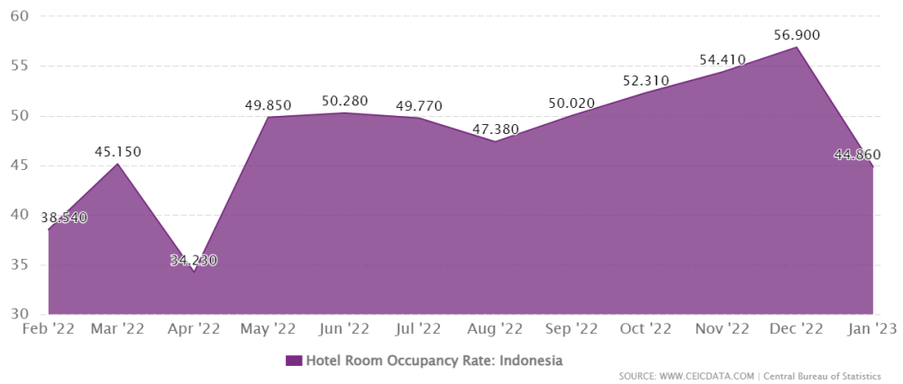
Figure 1.1 Hotel Room Occupancy Rate in Indonesia from Jan 2008 - Jan 2023

previous month. In May the hotel occupancy rate in Indonesia was reported with the total of 46,260%.