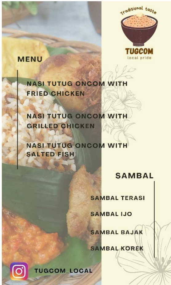
Figure 5.3 TUGCOM menu

TUGCOM uses Instagram to promote the product, and at the show, the writer also provides a mini banner containing information about TUGCOM's products.