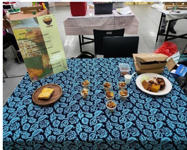
Figure 5.2 TUGCOM Product Presentation

During the exhibition, TUGCOM provides a food display on a plate and oncom. For testers, TUGCOM brings two variations of the flavours TUGCOM has. The writer also put one cup to serve each flavour.