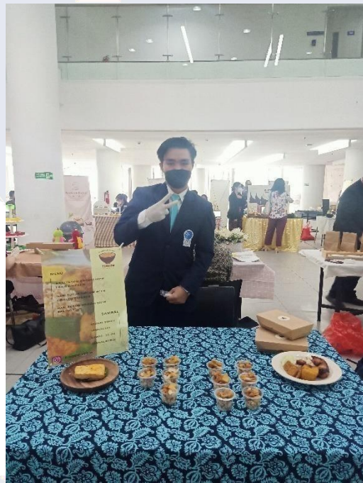
Figure 5.1 Booth Exhibition

The final project exhibition was held on November 12, 2021, at the lobby of D PK Ojong Universitas Multimedia Nusantara. The exhibition starts at 7 am and ends at noon.