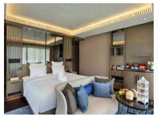
Figure 2.7 Studio Villa