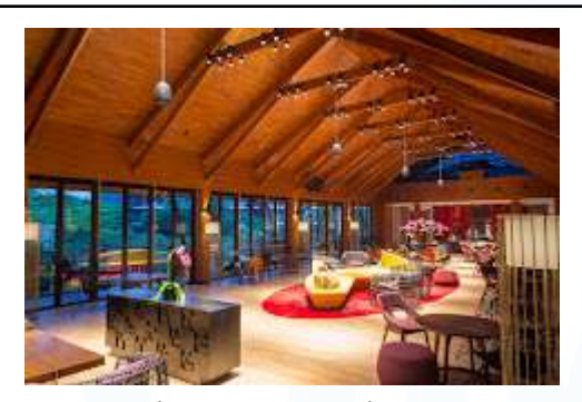
Figure 2.18 Mad Cow

Padi Pool Bar, is a restaurant with a special Balinese menu and also has a special Italian menu such as Pizza that is grilled directly on wood with an open kitchen theme.