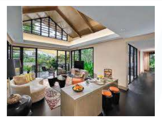
Figure 2.9 3 Bedrooms Villa (Sources: pullman-ciawi-vimalahills.com)

This villa measures 152 m2 with 2 bedrooms, living room, bathrooms with bathtub, balcony, karaoke.