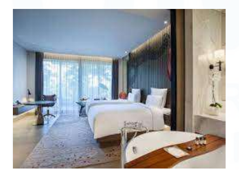
Figure 2.3 Executive Room

This room type is not much different from a Deluxe room, the only difference is access to the garden.