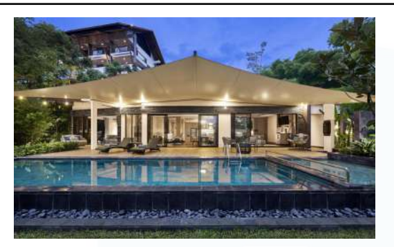
Figure 2.10 Junior presidential Villa