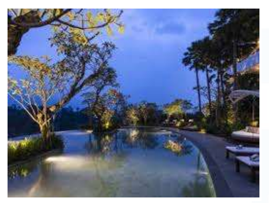
Figure 2.22 Infinity Pool

Infinity Pool, the depth for this swimming pool is 1.5 meters, is near the padi pool bar and near the Batur building, the view of this pool is hill and so many trees.