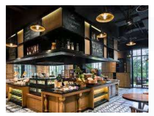
Figure 2.16 Damar Restaurant

Damar Restaurant, is the main restaurant which is a place for buffet breakfast, lunch and dinner. Damar Restaurant is also a venue for many events if the hotel has dinner events for various events