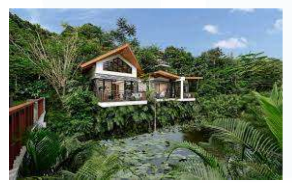
Figure 2.8 2 Bedrooms Villa

The 1 bedroom villa provides a space of 70m2 including a bedroom with a King Size bed and a bathroom with a bathtub and shower. And a free minibar containing snacks and drinks is also provided in each villa. And one of our studio villas also has a jacuzzi.