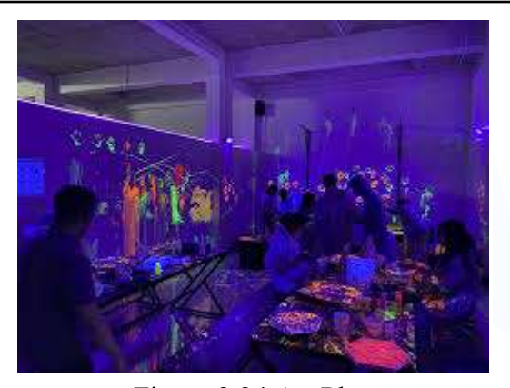
Figure 2.24 Art Play

Kids Playground, Pullman Ciawi provides kids playground and activities for kids who staying at this hotel for free, this