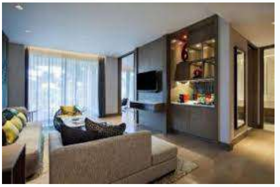
Figure 2.5 Suite Room

This room type has direct access to the swimming pool and this room type is also available with a bathtub