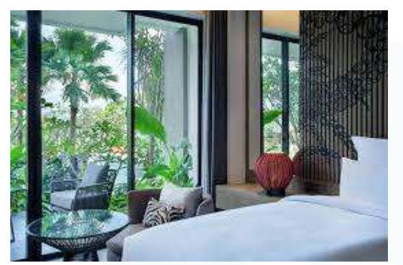
Figure 2.4 Deluxe Pool Access