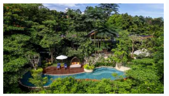
Figure 2.11 presidential Villa

Junior presidential villa is the second luxurious villa, the facilities are same with presidential villa.