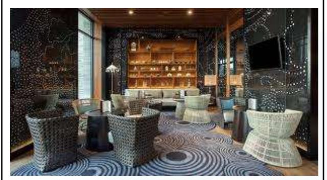
Figure 2.19 Salak Bar

Salak Bar is a lounge that only provides drinks and some snacks and desserts with a direct view of Mount Salak.