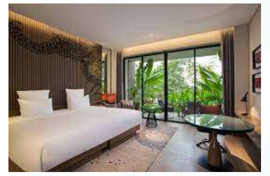
Figure 2.2 Deluxe Garden Access

This type is the most standard room type available, with an area of 42m2, this room is equipped with 1 king size bed / 2 single beds, complete with TV, AC, Wardrobe Bathroom Amenities, Balcony.