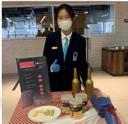
Figure 5.3 Exhibition