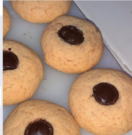
Figure 5.2 Sakura Cookies