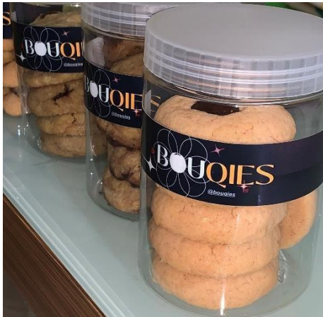
Figure 5.1 Chocolate Cookies

The Hotel Operations students should display their products in the square table to get evaluation from the lecturer and invited guest. Here's the display for BOUQIES on the exhibition.