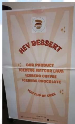
Figure 5.3 Hey Dessert Banner

For media and promotion, it is also important that the author uses an A3 banner which contains the Hey Dessert logo, the product name and also the Hey Dessert Instagram name.