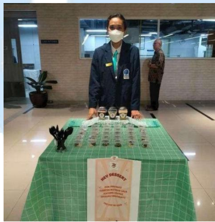
Figure 5. 1 Hey Dessert Booth

Exhibitions are also part of the final project. The author has participated in the exhibition which will be held on June 15 2023 and the location is at Multimedia Nusantara University, Building D, 3rd floor. In this exhibition the author displays what products will be sold and provides a short explanation about the products being offered.