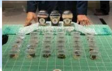
Figure 5.3 Product Presentation

In this exhibition, the author explains three products. The first is a Matcha dessert cup with a combination of sweet and bitter. This is also a taste that many people like. Meanwhile, the coffee dessert cup is tempting with its fragrant coffee aroma and rich taste. This coffee is intended by the author for people who like coffee. because this variant is not only for drinking, it can be enjoyed in the form of dessert