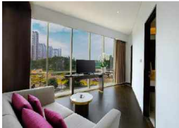
Picture 2.8 Family Suite Living Room

living room and a bathtub. However, there are also rooms choice with balcony that do not have a living room. This room offers the option of a king-size bed or twin beds, with 1 king-size bed and 1 twin bed. The facilities provided are similar to those in other suite rooms, such as a safe deposit box, smart television, minibar, body scale, kettle, a work desk with a chair, bathroom amenities, slippers, and a tea and coffee set.