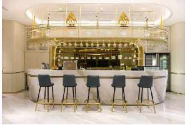
Picture 2.13 Bateeq Lounge

Bateeq Lounge also serves as the provider of welcome drink for guests checking in.