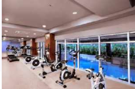
Picture 2.18 Gym & Fitness

source : https://parador-hotels.com/atria-hotel-gading-serpong