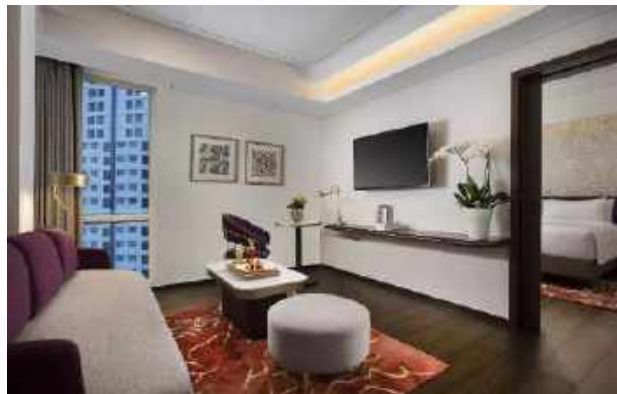
Picture 2.7 Suite Room

The Suite Room has a size of 50 square meters and features 1 living room as well as 2 televisions, one in the bedroom and living room, the bathroom also included with a bathtub. This Suite Room specifically offers only king-size bed. Other facilities are the same and include a safe deposit box, smart television, minibar, body scale, kettle, a work desk with a chair, bathroom amenities, slippers, and a tea and coffee set.