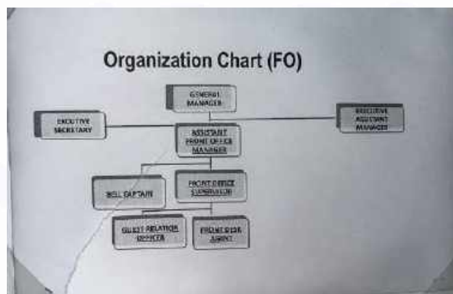
Picture 21 Front Office Organizational Structure

source : https://parador-hotels.com/atria-hotel-gading-serpong