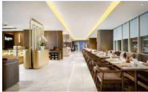
Picture 2.11 Legen Restaurant

source : https://parador-hotels.com/atria-hotel-gading-serpong