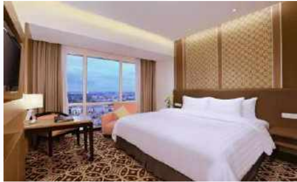
Picture 2.3 Deluxe Room

source : https://parador-hotels.com/atRIA-hotel-gading-serpong