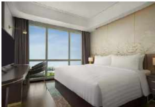
Picture 2.4 Premiere Room

The Premiere Room is similar to the Deluxe Room, with a size of 25 square meters and the option of either a king-sized bed or twin beds. The main difference is in the bed size and this room is already being renovated. This room also accommodates 2 people and includes amenities such a safe deposit box, smart television kettle, a work desk with a chair and table, bathroom amenities, minibar, slippers, and a tea & coffee set.