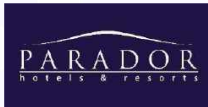
Picture 2.1 Logo Parador Hotels & Resort Group

2012. Parador Hotels & Resorts currently operates 11 hotels across Indonesia. The company owns 5 hotel brands ranging from 4-star to 1-star, including Vega Hotels, Atria Hotels, Fame Hotels, and Starlet Hotels. Parador Hotels & Resorts aims to become the largest hotel operator based in Indonesia, with the highest quality standards at each of its hotel units.