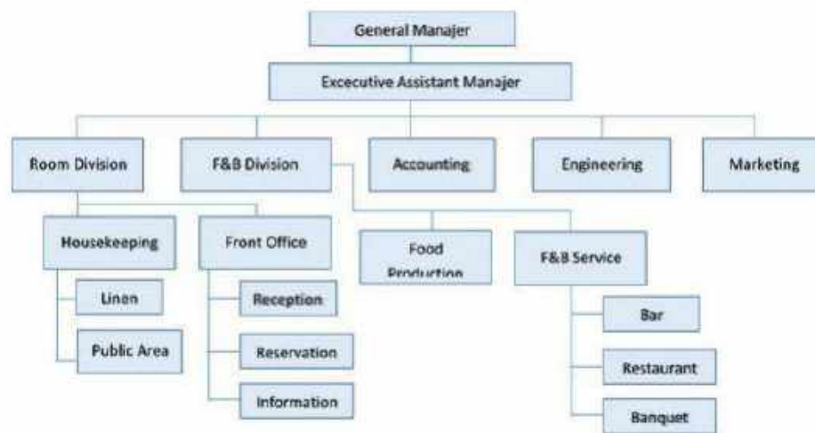
Picture 20 Hotel Organizational Structure

The structure of an organization is an important thing to many companies. Organization Structure is an arrangement of positions or roles inside an to achieve the company goals. The organizational structure can either be hierarchical with various levels of management or divisional with separate product lines and divisions.