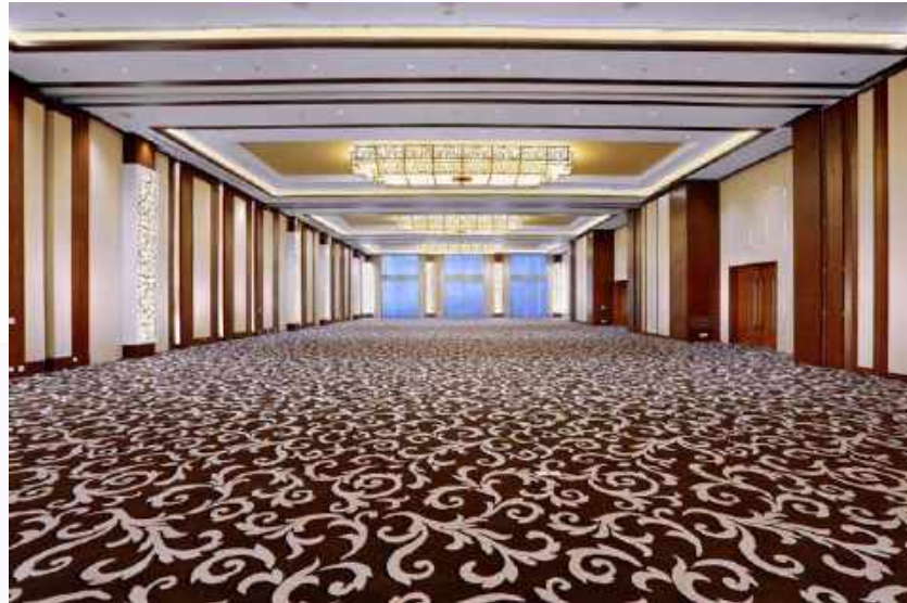
Picture 2.16 Grand Ballroom

source : https://parador-hotels.com/atria-hotel-gading-serpong