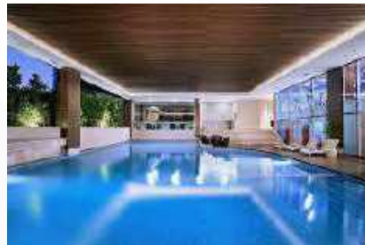
Picture 2.19 Swimming Pool

The swimming pool is also located on the Ground Floor, near the playground and gym. This pool features a semi outdoor concept, complete with a children's pool and an adult pool. Towels are also available for rental at the swimming pool area. The operational hours are from 6.00 AM to 6.00 PM.