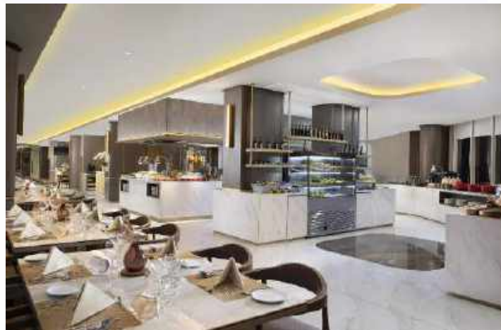
Picture 2.12 Legen Restaurant

source : https://parador-hotels.com/atria-hotel-gading-serpong