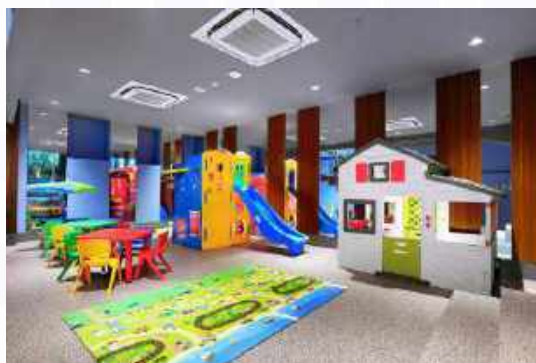
Picture 2.17 Kids Plyaground

The kid's playground and gym are located on the Ground Floor. The operating hours are from 6.00 AM to 8.00 PM. Both the gym and kid's playground are available for use by all hotel guests.