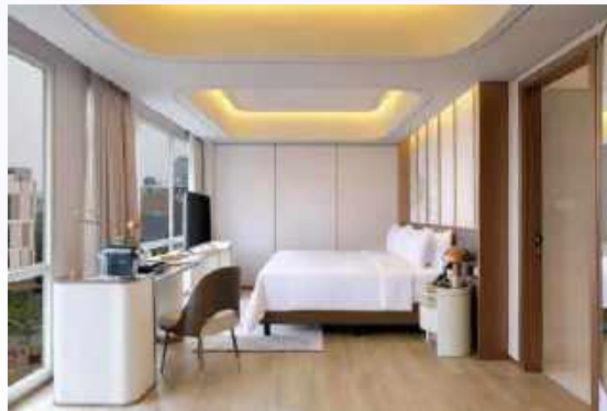
Picture 2.10 Royal Suite Room

The Royal Suite is the highest type at Atria Hotel Gading Serpong. With a size of 142 square meters, this room is located on the 3 rd Floor with a city view. It accommodates up to 4 people and is equipped with a kitchen area, dining table, living room, TV with karaoke, private pool, and a bathroom with a bathtub. Other facilities are similar to those in other rooms. Guests staying in this suite can also choose breakfast at the restaurant or a floating breakfast in the private pool, along with afternoon tea and a VIP fruit set.