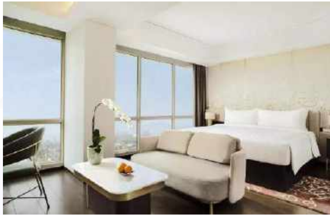
Picture 2.6 Junior Suite Room

source : https://parador-hotels.com/atria-hotel-gading-serpong