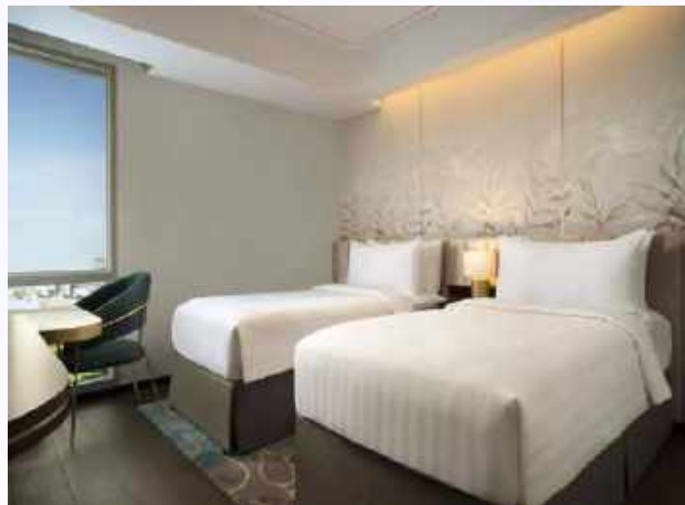
Picture 2.5 Premiere Corner Room

square meters. The difference in facilities is minimal, with the main distinction being its corner location and larger size. The room amenities include a safe deposit box, smart television, kettle, a work desk with a chair and table, bathroom amenities, minibar, slippers, and a tea & coffee set.