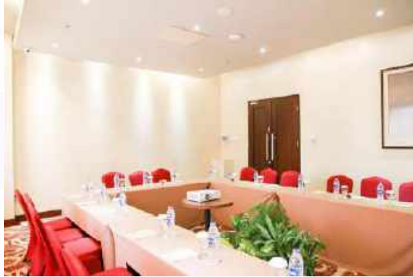
Picture 2.14 Meeting Room Ivory 3

source : https://parador-hotels.com/atria-hotel-gading-serpong