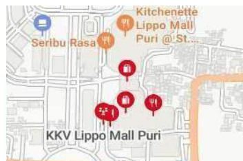
Figure 3.1 Location

Another reason why choosing to open at Lippo Mall Puri or in Jakarta in general it iss because of the population being massive. That means a higher chance of Knowing GoGetBig through offline Promotions. GoGetBig will open the establishment to be precise in outside of fitness first Gym.