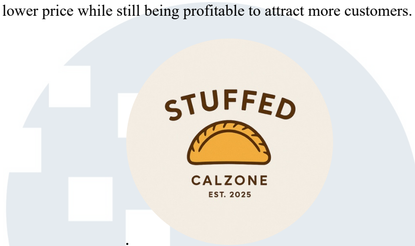
Figure 1.1 STUFFED Brand’s Logo

create various types of fillings to make it more interesting, and, most importantly, offer a lower price while still being profitable to attract more customers.