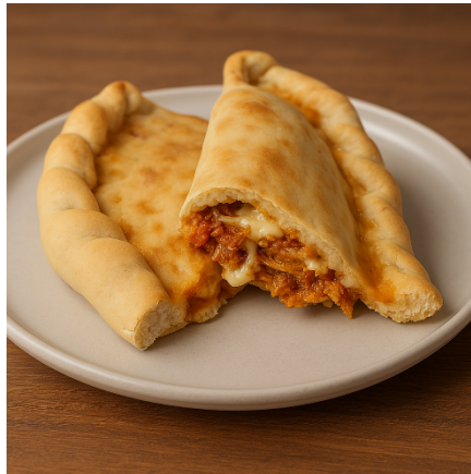
Figure 1.5 Chicken Gulai Variant

Chicken Gulai might seem skeptical to some people since it's mostly served as a soup, but not in STUFFED. This Chicken Gulai will be served with sauce consistency with a strong presence of Indonesian herbs. With the shredded chicken thigh that was cooked with the Gulai sauce, STUFFED ensured the richness of flavours on it.