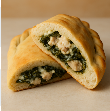
Figure 1.4 Creamy Spinach Variant

The creaminess between spinach and shredded chicken thigh burst inside the mouth. Creamy Spinach will give a creamy sensation combined with a little bit of crunch from the spinach and the juicy from the shredded chicken thigh.