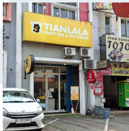
Figure 1.3 Photos of Tianlala Store

To create a new concept, STUFFED tried to combine the calzone concept with unique fillings not only from the West but also from Indonesian cuisine. The owner of STUFFED really tries to make a big innovation in Indonesian traditional dishes, turning them into a whole new concept compared to what they usually look or taste like. STUFFED will be selling its product in 5 different fillings : Creamy Spinach, Chicken Gulai, Ayam Kecap, Cheese Burger, and Cakalang Balado. Each variant will have a distinct taste that suits the bread, no matter what. STUFFED believes it will be the pioneer in combining Indonesian and Italian tastes. Furthermore, below are the details of STUFFED products.