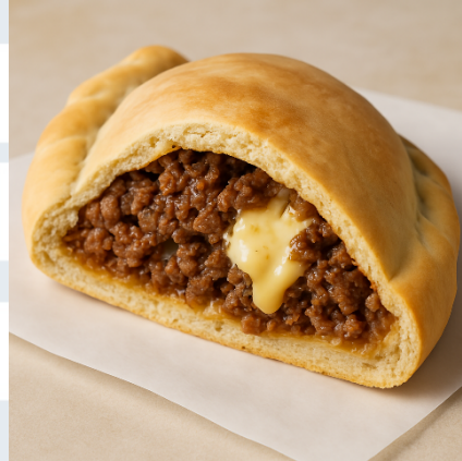
Figure 1.8 Cheese Burger Variant

The last but also the most familiar taste to the consumer is cheese burger. A combination between the taste of the ground beef and the cheesiness from the cheese will always melt in the mouth.