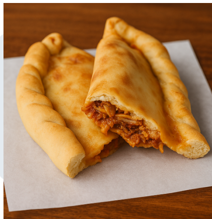
Figure 1.7 Cakalang Balado Variant

Cakalang Balado is one of the comfiest foods for the owner of STUFFED. A dish that will never go wrong with freshly cooked rice. The