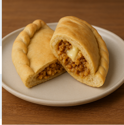
Figure 1.6 Ayam Kecap Variant

Besides Chicken Gulai, STUFFED try to present a “homey” taste to the consumers by making Ayam Kecap fillings that are similar to those used in Sosis Solo and Bakmi Ayam. This fillings will bring you comfort and the memories while eating it with your family. The combination of sweet and umami taste will burst in every bite that is eaten.