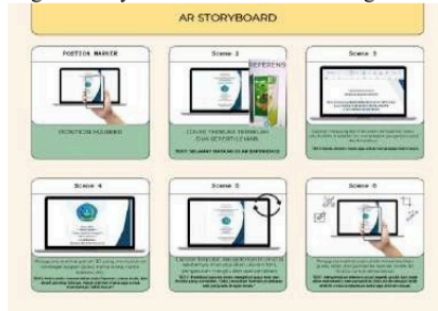
Figure 4. Storyboard Pengembangan Media AR

The following is a storyboard in the AR creation guidelines