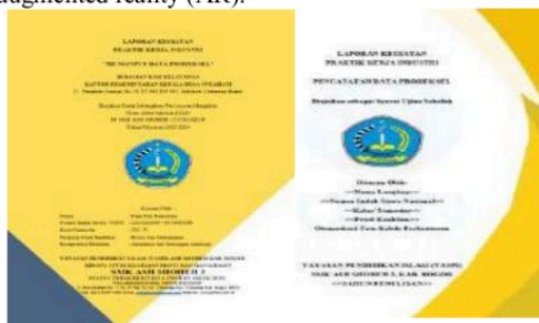
Figure 2. Ash Shoheh Internship Report Cover 2 (Left: Before and Right: After Research)

The author designs an internship report that will be used as research. The design process begins by creating an internship report so that it conforms to the rules used and generalities in writing internship reports. At this stage, the author makes a focused discussion to adjust the internship report starting from the cover to the bibliography. After finalizing the internship report guide, the author started by creating a storyboard for creating augmented reality (AR).