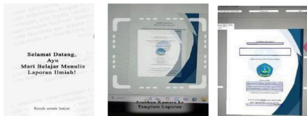
Figure 6. Views 4—6 Augmented Reality

Figure 5 shows the Augmented Reality display with an opening (left side) with the words "AR Industrial Work Practices Report". Followed by the teacher and students filling in their personal data. After filling in personal data, teachers and students can continue by pressing the green arrow. Filling in personal data in Augmented Reality provides a more personal learning experience for teachers and students.