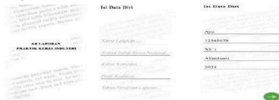
Figure 5. Views 1—3 Augmented Reality

In the implementation stage, teachers and students use augmented reality (AR) when practicing writing skills. The augmented reality display starts with the following: