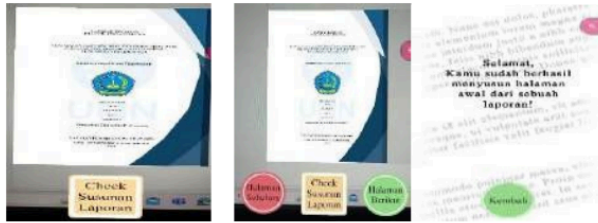
Figure 7. Views 7—9 Augmented Reality